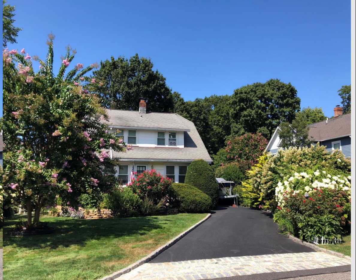
47 Fenwick Street, Greenlawn