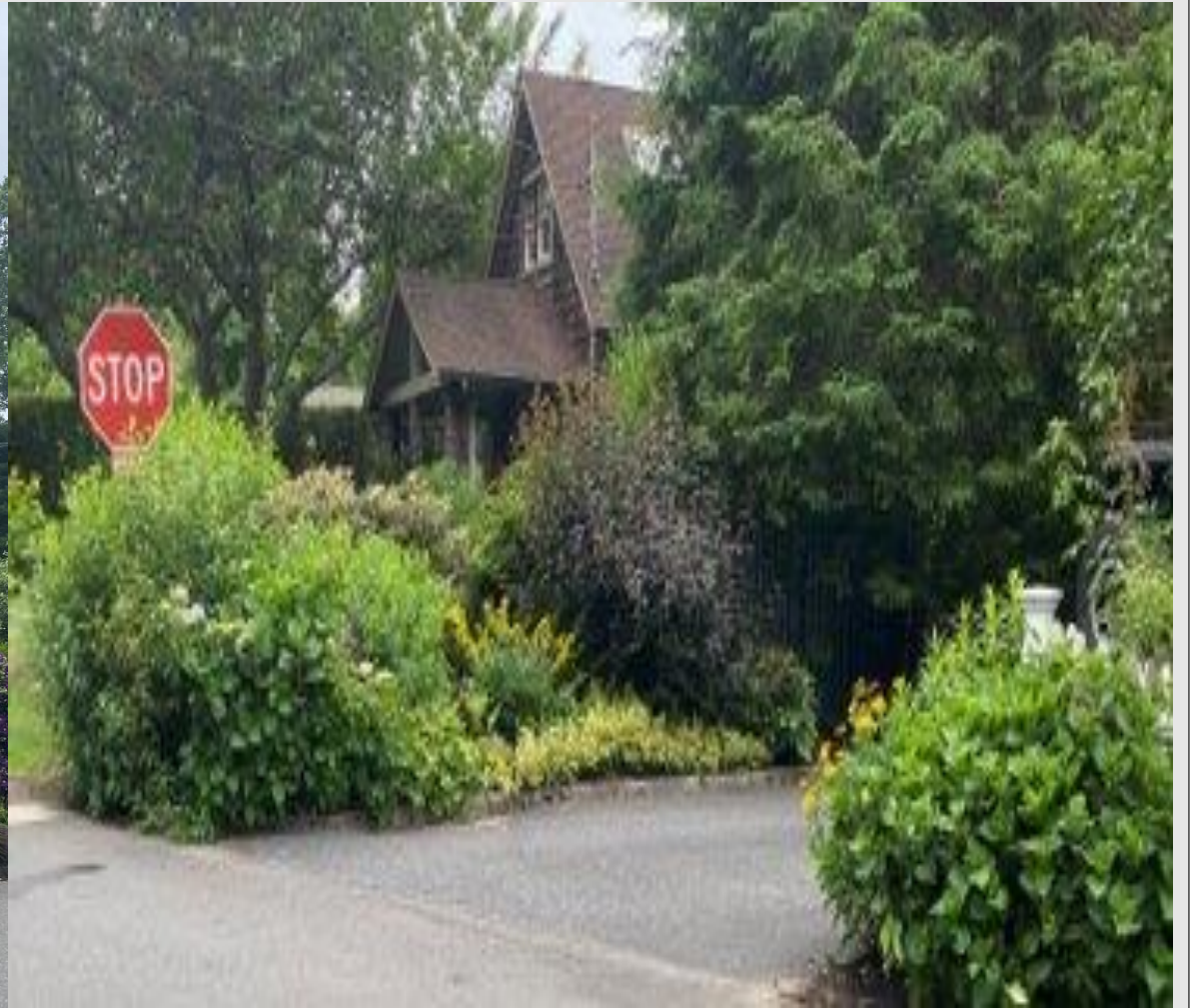
1 Pine Place, Greenlawn