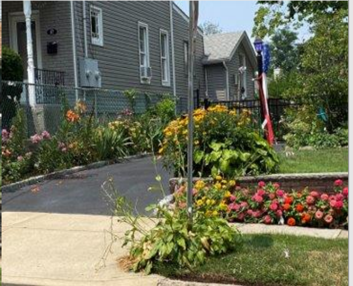
91 Elm Street, Huntington