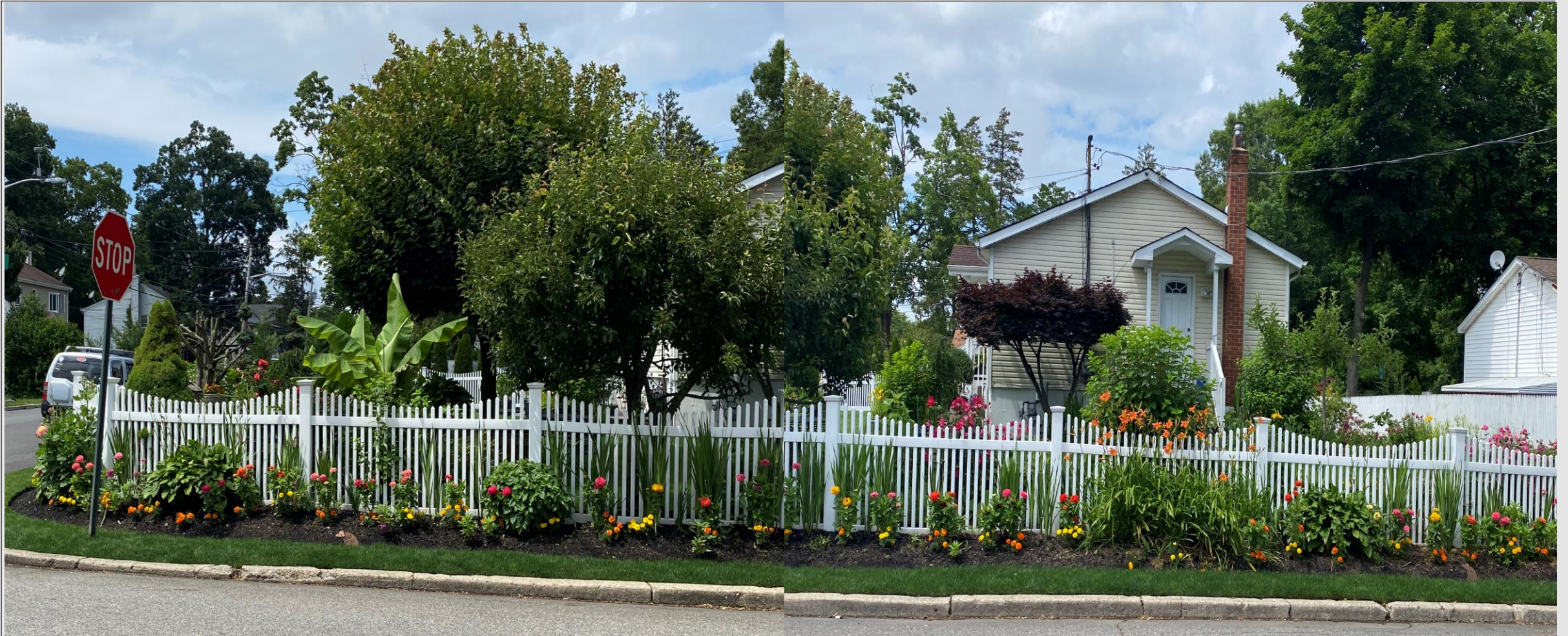
50 10th Avenue, Huntington Station