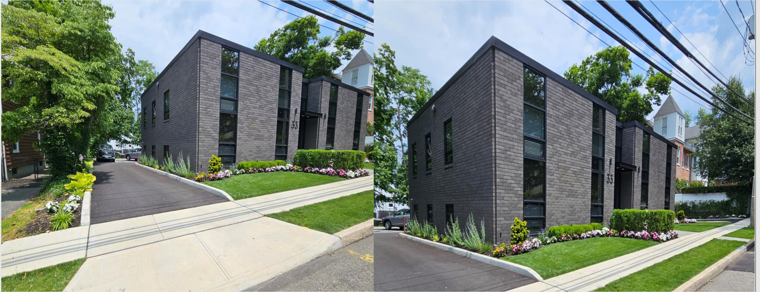
33 East Carver Street, Huntington