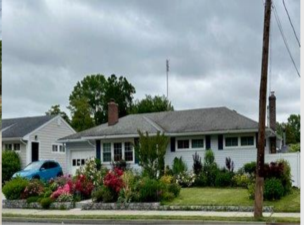
506 Oakwood Road, Huntington