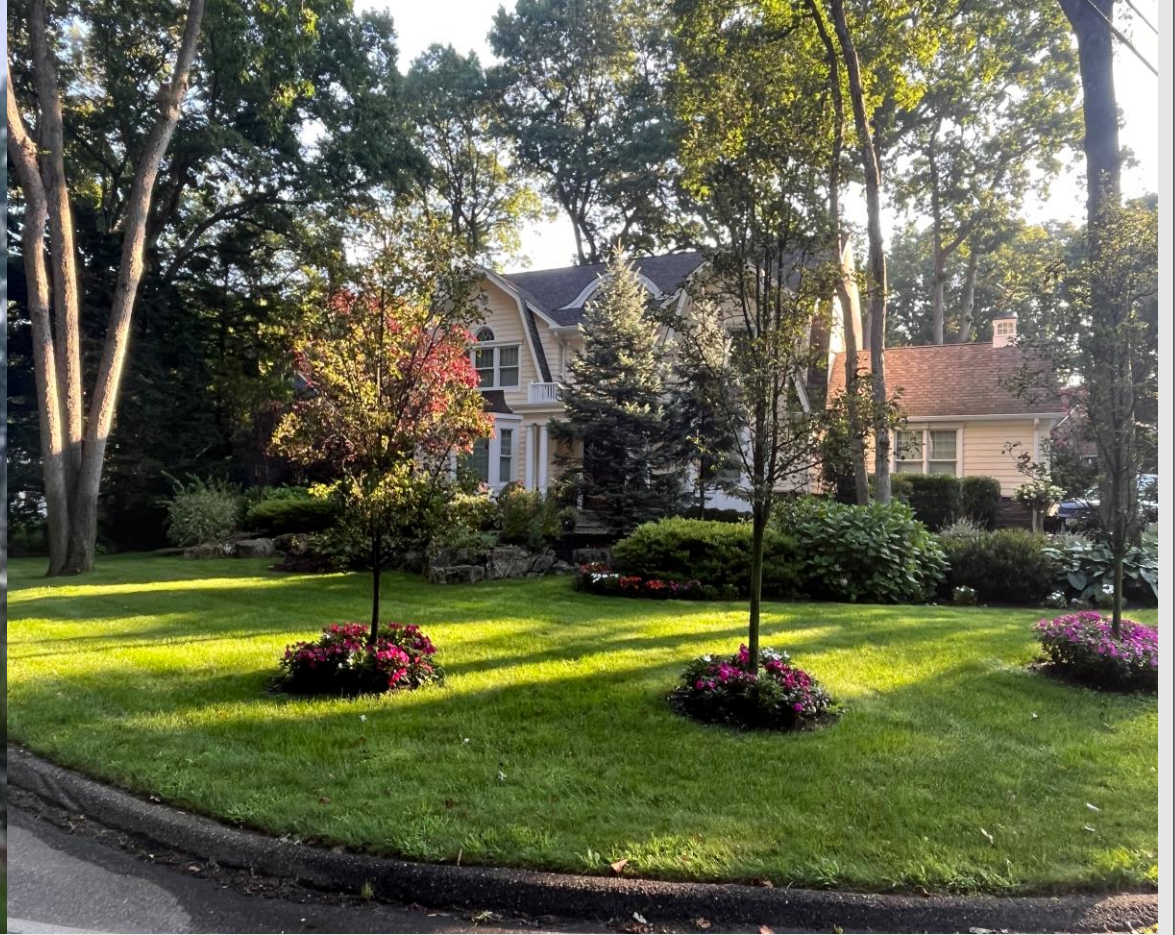
59 Cold Spring Hills Road, Huntington