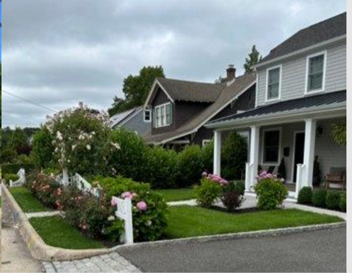
47 Oakland Street, Huntington