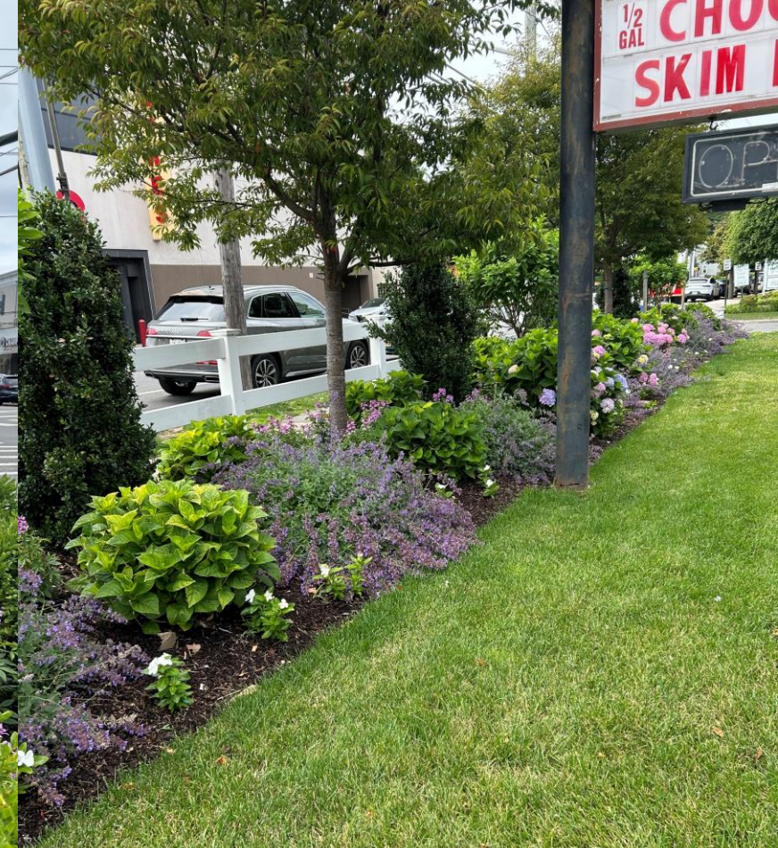
THE BARN 39 GERARD STREET, HUNTINGTON