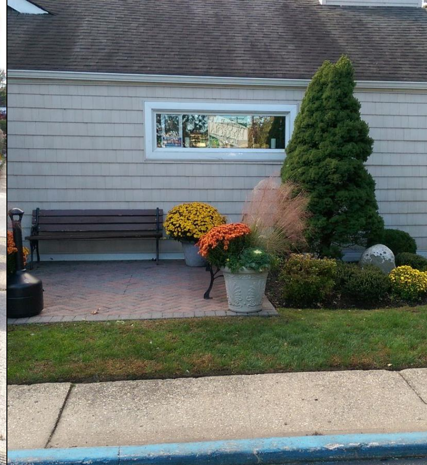
PICCOLO BUSSOLA 970 W. JERICHO TURNPIKE, HUNTINGTON