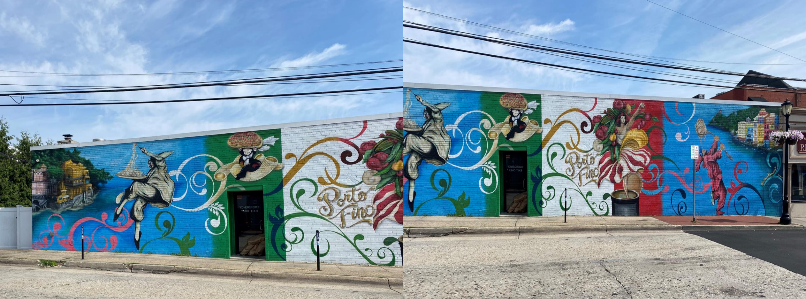
PORTOFINO 395 NEW YORK AVENUE, HUNTINGTON