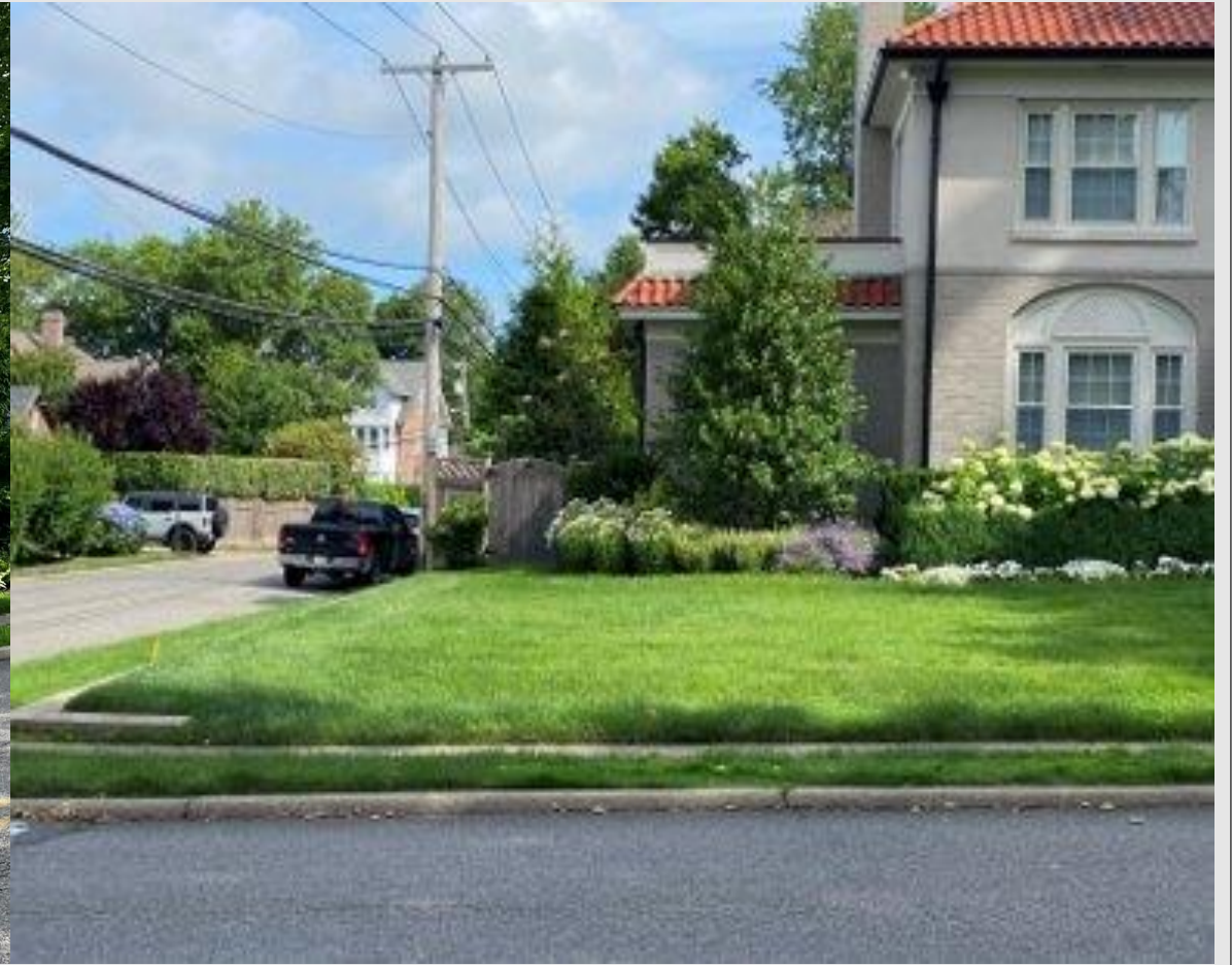
41 Fairview Street, Huntington