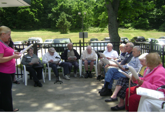
* Coordinated respite care & caregiver programs are funded by the Town of Huntington, the U.S. Administration for Community Living through NYS Office for the Aging and Suffolk County Office for the Aging.