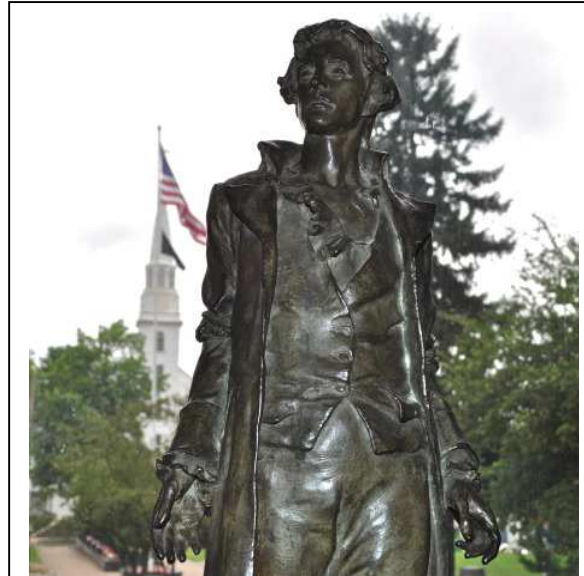
Huntington's Nathan Hale statue is a model of the 13-foot bronze sculpted by Frederick MacMonnies that stands opposite New York City Hall.

HALE IN HUNTINGTON: In 1893, Frederick MacMonnie's 13 foot tall bronze statue of Nathan Hale was dedicated in New York's City Hall Park. Huntingtonians felt that a memorial should also be placed in Huntington since the shores of Huntington Bay are where Nathan Hale began his spying mission in September 1776. Two memorials were erected. On Main Street, you can find a large marble shaft in front of the Soldiers & Sailors Memorial Building and on Mill Dam Road a large granite boulder stands near the shore of Huntington Bay where Hale crossed enemy lines during the Revolution. In addition, the Town of Huntington owns a small copy of MacMonnies bronze statue which is kept in the Town Clerk's archives and is on display for public viewing once a year during the week of July 4th.