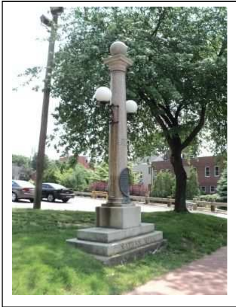
Nathan Hale Memorial Main Street, Huntington Village.